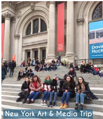
New York Art & Media Trip