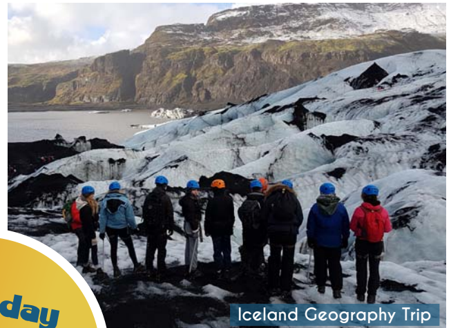
Iceland Geography Trip

All Year 11 students at any school considering their Post 16 options are welcome to attend.