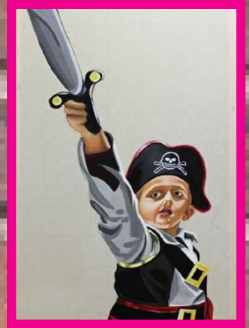
Artworks created by WBHS students